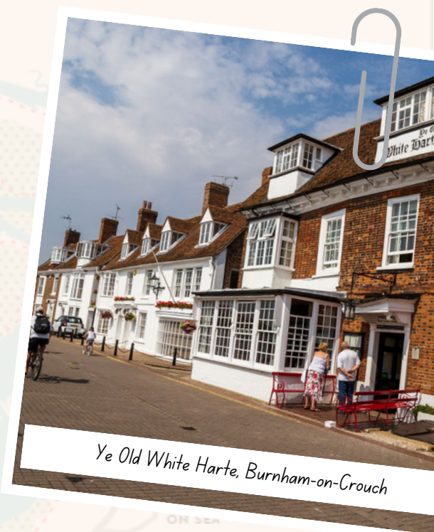
Ye Old White Harte, Burnham-on-Crouch