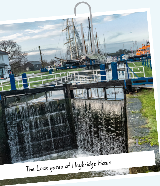
The Lock gates at Heybridge Basin

Look out for the old County Court (now a private house) on the right-hand side (with its Royal coat of arms), built in 1858 to handle civil law cases then used as a Magistrates' Court. At the end of London Road, turn left onto Maldon High Street. You will soon pass the 13th-century All Saints' Church and 15th-century Moot Hall on the left. Go ahead on the High Street for 900 yards, until you reach Church Street.