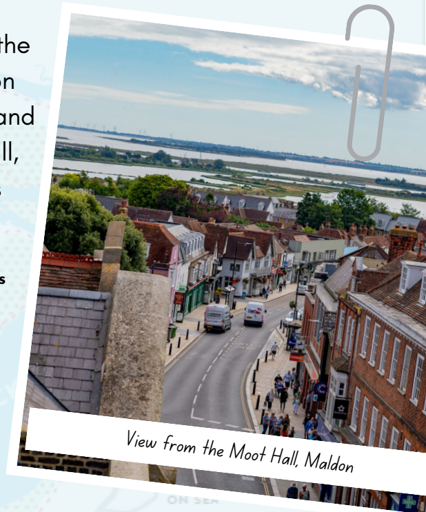
View from the Moot Hall, Maldon